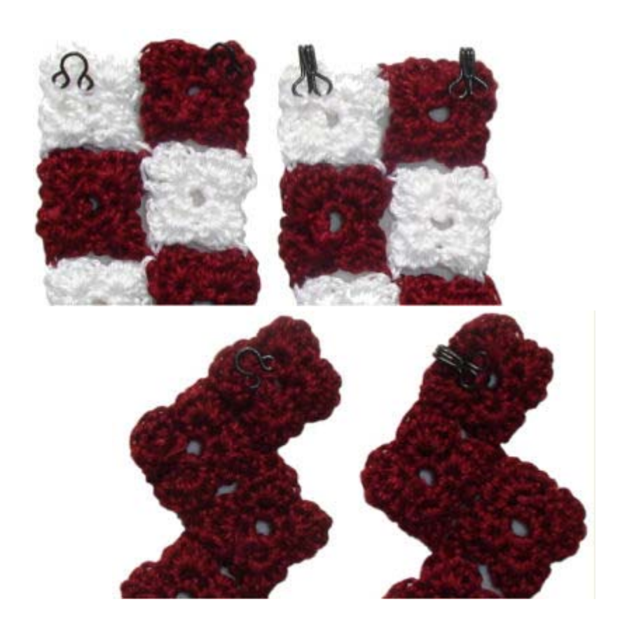
Designed by FlexibleFashions.net Copyright © 2010 • All Rights Reserved